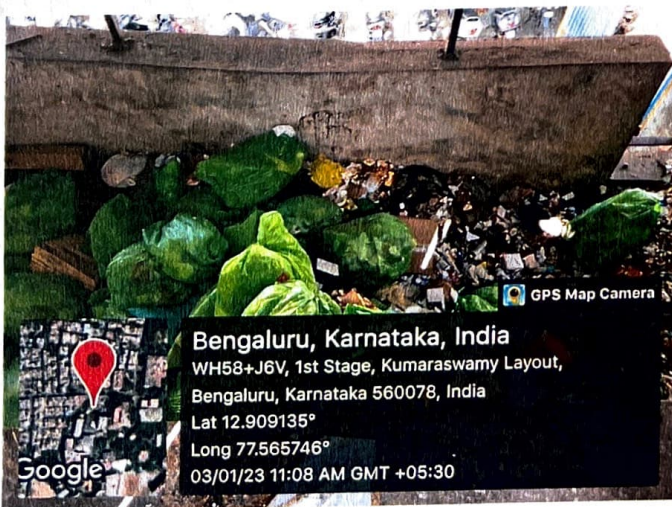
WET WASTE MANAGEMENT