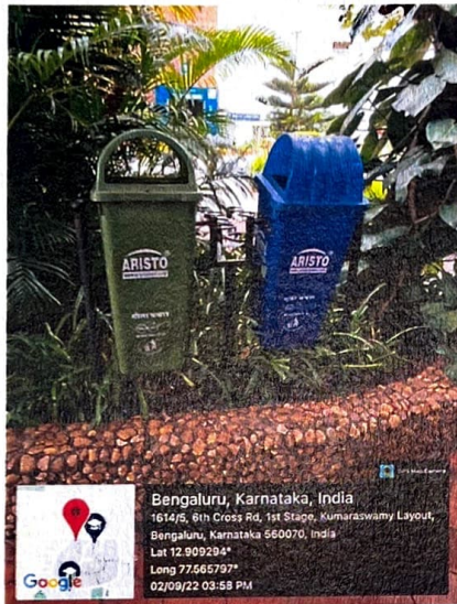
SOLID WASTE MANAGEMENT