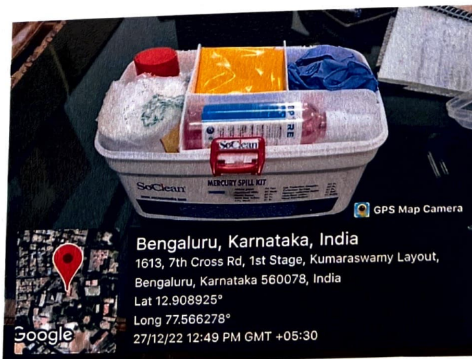
MERCURY SPILL KIT IN DEPARTMENT OF CONSERVATIVE DENTISTRY

PRINCIPAL Dayananda Sagar College of Dental Sciences Kumaraswamy Layout, Bangalore - 560 078;